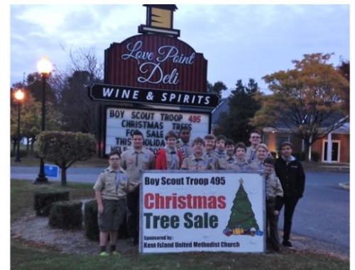
Boy Scout Troop 495 Christmas Tree Sales p.2